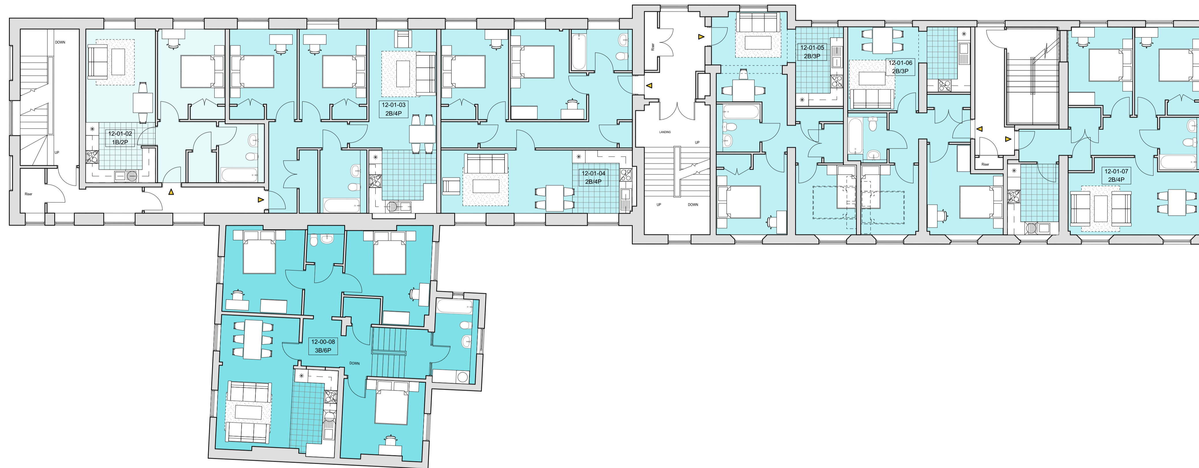
Proposed First Floor